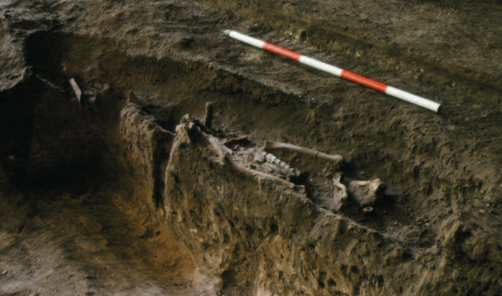
A Neolithic inhumation burial excavated by the Niah Cave Project in 2003.

Barbara Harrisson classified the Neolithic burials she excavated into a broad chronological sequence. The earliest graves were extended inhumations where the bodies were placed in wooden coffins fashioned from hollowed-out logs or crude planks. In later burials, bodies (sometimes partially burned) were placed in large ceramic vessels. Grave-goods included pots, stone axes and grinders, beads, basketry, and textiles.